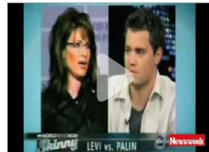
The Daily Obsession: A Palin-Levi Reality TV Duel 3/31/10: The 'family that keeps on giving' stirs up more made-for-TV drama as the former Alaska governor's 'grandbabydaddy' pitches his own Alaska reality TV show.