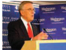
Senator Byron Dorgan Washington Monthly/New America event "Risky Business"

Read the 10/1994 Article Watch the 10/2009 Video