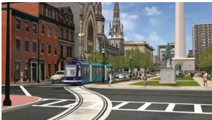
The Future: In a rendering, a modern streetcar negotiates Mount Vernon Place. | illustration by Newlands & Company

When talking about the Charles Street streetcar, it's useful to spell out exactly what it isn't. The trolley isn't part of the MTA's Red Line, the ambitious mass transit project due to run 14 miles from Woodlawn to Hopkins-Bayview by 2016. Currently, City Hall and the Greater Baltimore Committee favor a plan for the Red Line dubbed Alternative 4C, which involves light-rail trains traveling underground through downtown, emerging in East and West Baltimore. Light rail systems such as the current Maryland Transit Administration's Light Rail are generally faster, bigger, and more intrusive than trolley lines: The long trains of light-rail cars can't share the road with traffic, as streetcars can. The MTA is supposed to decide what form the Red Line will take this summer.