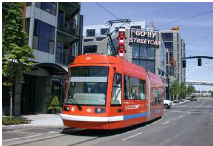
Trolley revival: The modern streetcar line that opened in Portland, Oregon, in 2001 was the first in the country to use new, Czech-made vehicles such as this.

By the time the last streetcar—the no. 8—limped up York Road for its final run in November 1963, no one was exactly shocked. "People still loved streetcars—even at the end," Kelly says. "But you could see what was happening. We were losing the core of the city to cars."