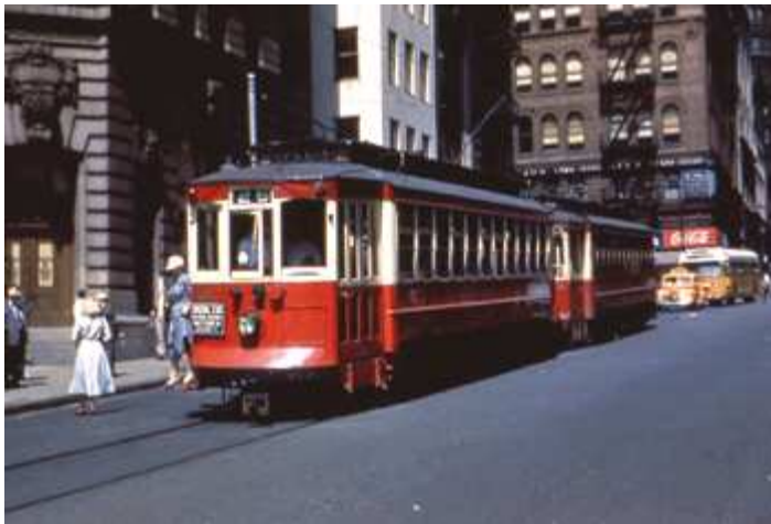
The Past: A Baltimore Transit Company trolley on Charles Street in 1948.

Like streetcar proponents in dozens of other cities that are either building or planning back-to-the-future trolley lines, Baltimore's heritage rail enthusiasts are following a trend set by Portland, Oregon, whose modern streetcar system—the first since the 1940s to use new vehicles—inspires wide-eyed reverence among transit fans. More than $3 billion in investment has sprung up within a couple of blocks of Portland's trolley line since it opened in 2001, according to Portland Streetcar Inc., the nonprofit corporation that manages the city-owned system. Property values nearby have shot up, and ridership has remained strong and steady.