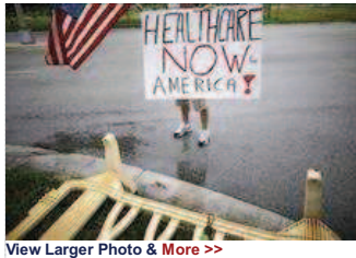
View Larger Photo & More >>

It used to be said that there is no such thing as a free lunch. But when it comes to health care reform, President Obama appears to be offering up a free breakfast, lunch, dinner and bedtime snack.