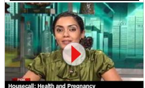
Housecall: Health and Pregnancy