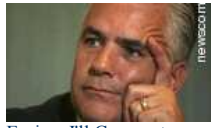
Ensign: I'll Cooperate With Ethics Probe Into Help For Mistress's Husband