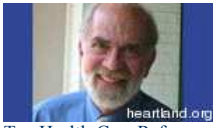
Top Health-Care Reform Foe: Racist Emailer Is "Rock Solid Patriot"