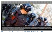
Scrubbed: APF Web Page That Claimed Ownership Of Blackwater Training Center Now Reads 'ETA Spring 2010'