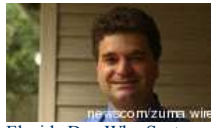
Florida Doc Who Sent Obama Witch-Doctor Email Still Helping Lead Anti-Reform Fight