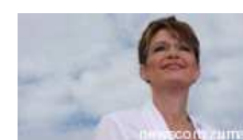
From Dollars To Death Panels: How Republicans Distorted Debates On Capitol Hill