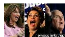
Top 10 Wild And Wacky Political Voices -- For Whom We're All Very Thankful