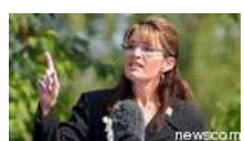
Sarah Palin: Hero Of Talk Radio Listeners -- But Anyone Else?