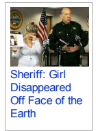
Sheriff: Girl Disappeared Off Face of the Earth