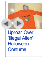
Uproar Over 'Illegal Alien' Halloween Costume