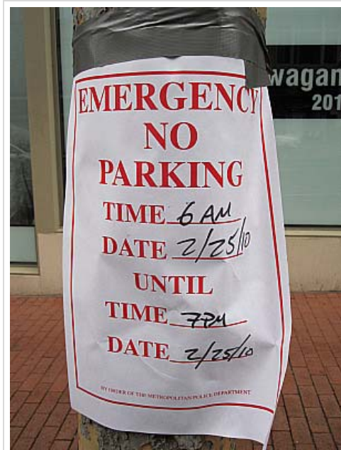
This sign design may soon be extinct.

Comment Print Email RSS Subscribe Previous