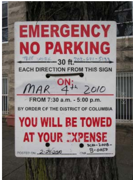
Alternative Emergency No Parking sign design.