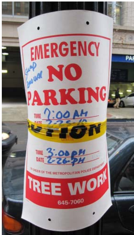
Emergency No Parking sign, tree work edition.