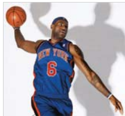
Why LeBron Should Sign With the Knicks

Lloyd of Our Lives Lloyd Blankfein Is Just Glad That This Crisis Was Able To Bring Him Closer To His Clients