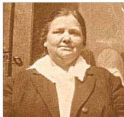
Ellis Island's First Immigrant