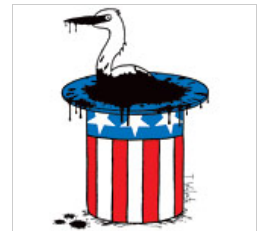
How the Gulf Oil Spill Helps Obama's Agenda