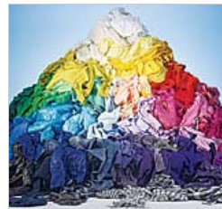
When Did Uniqlo Become City's Hottest Retailer?