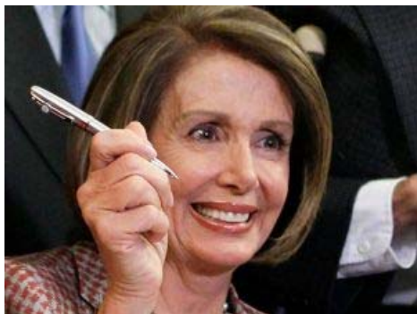
WASHINGTON - MARCH 26: U.S. Speaker of the House Rep. Nancy Pelosi (D-CA) signs the revised Health Care and Education Reconciliation Act during an enrollment ceremony as Rep. John Dingell (D-MI) (R), and Rep. Peter Welch (D-VT) (L) look on March 26, 2010 on Capitol Hill in Washington, DC. The House passed the bill that completed health care reform by a vote of 220 to 207.

A few days later it was announced that Social Security will pay out more in benefits this year than it takes in. So, Ms. Pelosi compared Obamacare to another sweeping government entitlement program, one which is going into the red even sooner than predicted.