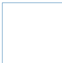
Top Shelf Garment Rack SamsClub.com