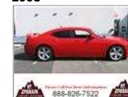
$34,999 Mt. Ephraim Chrysler Dodge (856) 931-2000