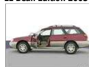
$14,995 Rafferty Subaru 610-353-6900