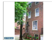
$459,900 1016 Waverly St