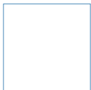
47" Philips LCD 1080p HDTV SamsClub.com