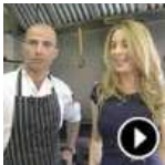
The Philly Dish: Cooking over a wood fire at Alba