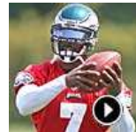
Michael Vick joins Eagles