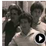
Mob Scene: Brother vs. Brother