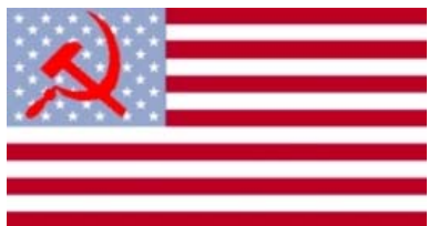
The ObamaNation Flag