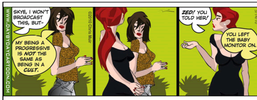
Commentary, News Analysis and Opinion without a hidden agenda