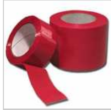
CEI Weekly: CEI Releases 2011 Edition of Ten Thousand Commandments