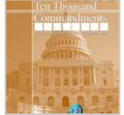
Ten Thousand Commandments