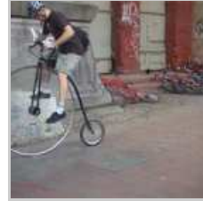
Stated Housing Preferences vs. Revealed Housing Reality