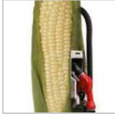
Biofuels Policy – Death and Disease Follow