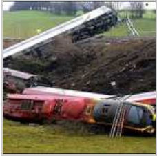
High-Speed Rail: A Bad Idea in the U.S., a Bad Idea in China

REGULATION ECONOMY ENERGY ENVIRONMENT INTERNATIONAL LEGAL INDV. LIBERTY ABOUT