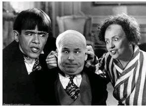
( http://thepeopledecide.us/ )