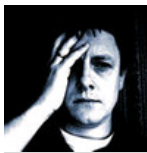
( http://thepeopledecide.us/ )