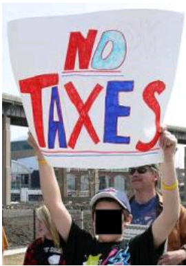
( http://img22.imageshack.us/my.php?image=teapartystupidity.jpg )

Share this image on Twitter! ( http://q.imageshack.us/img22/teapartystupidity.jpg/1/ )