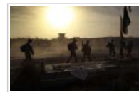
The United States and Allies Prepare for the Coming Kandahar Offensive