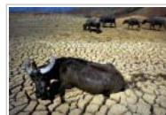
The Big Thirsty: Scenes from the World's Water Crises