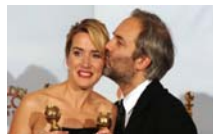
Oscar-winner Kate Winslet splits from director husband