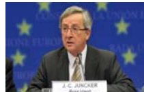
Eurogroup endorses Greek austerity measures, offering no bailout plan