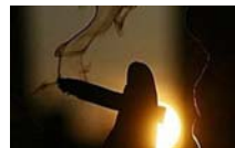
Quitting smoking improves artery health