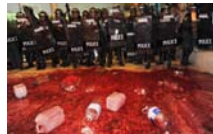
Thai Red shirts pour blood in front of Gov't House