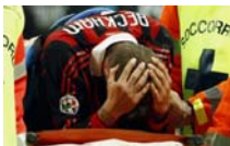
Beckham's surgery completed