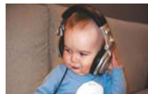
Babies inborn to response to music