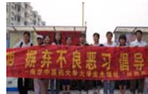
13 China colleges to offer anti-smoking courses