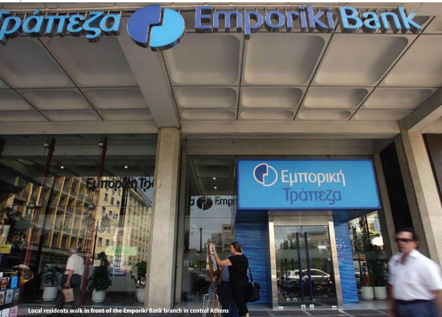
Local residents walk in front of the Emporiki Bank branch in central Athens