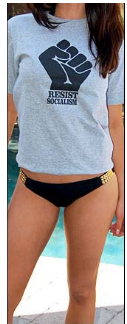
www.thoseshirts.com Ads by Google

dfd | 5.25.10 @ 4:32PM | # What? You mean they might actually move away to other places when work is hard to find, just like all those "real" 'mericans do? Since when are they here looking to work? I thought your