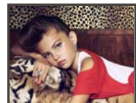
Too Young to Model?