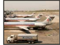
The FAA's Dangerous Shutdown

MENTAL HEALTH BREAK | MAIN | MATCHING OUR HIDDEN DESIRES