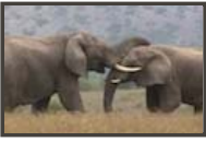
The GOP At War With Itself