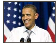
Life Gets Better at 50