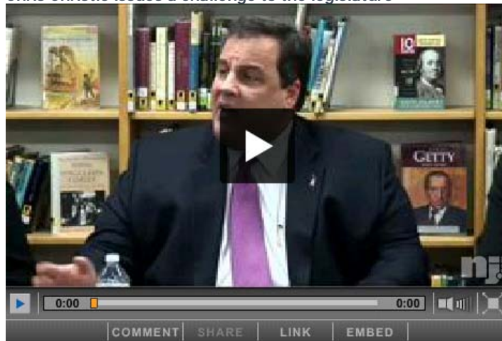
Christie announces cuts to 375 different state programs