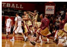
NJSIAA boys basketball North Jersey Non-Public B state sectional final