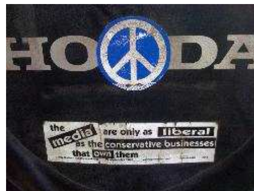
in Seattle, Christmastime 2009

Last week I covered Olbermann's current corporate employer, General Electric, which has a lobbying agenda that hews very close to Obama's agenda and political action committee donations that favor Democrats. Looking at Olbermann's future employer, Comcast , there's a similar pattern.