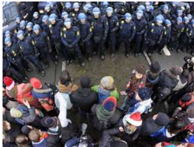
Police officers ward off climate change protesters in Copenhagen