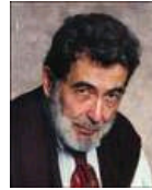
NAT HENTOFF (Columnist)