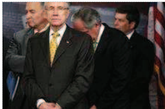
View Larger Photo & More >>

When you knowingly pay someone to lie to you, we call the deceiver an illusionist or a magician. When you unwittingly pay someone to do the same thing, I call him a politician.