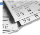
Nullify Now Tour