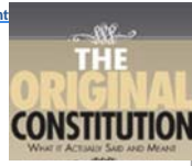
New Book Available!