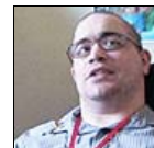
VIDEO: Look at that guy