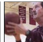
VIDEO: Shooting hoops with Herb Magee