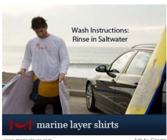
www marinelayer com

How to survive the coming food shortage.