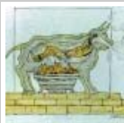
10 Bizarre Torture Methods