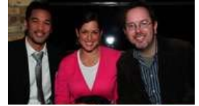
Tweetup photos on shots in the dark