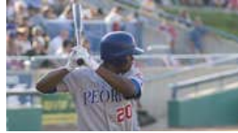
Third base prospects on w rigley bound