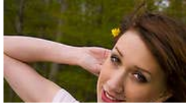
Wanna frag? on gamesmith