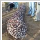
Weird creature measured 6ft long