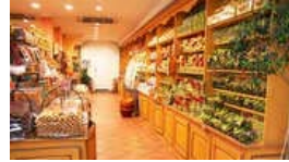
Grocery store inspiration on the green mama