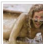
Dirty fun at mud festival