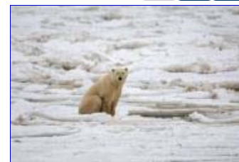
Koch Industries funded a campaign that said polar bears were not endangered by climate change, a Greenpeace report said