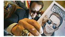
Schwarzenegger puts Hollywood comeback on hold