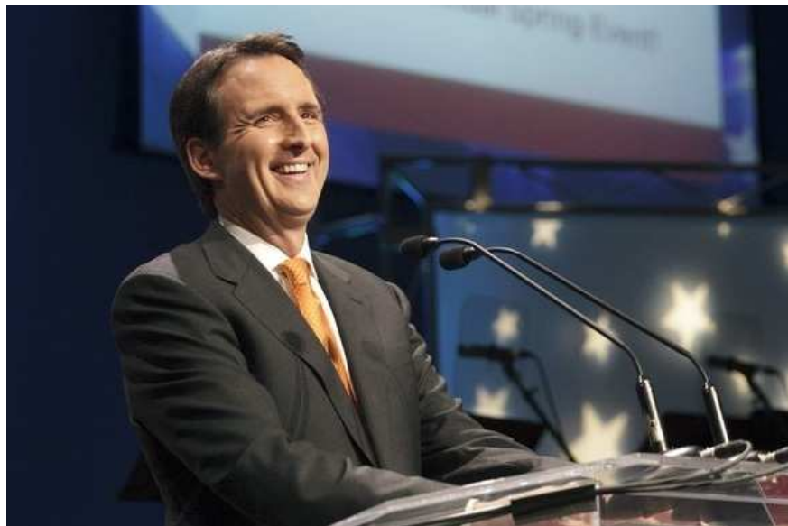
Former Minnesota Gov. Tim Pawlenty, pictured speaking in Iowa in March, will announce his formal candidacy for president in the state on Monday.