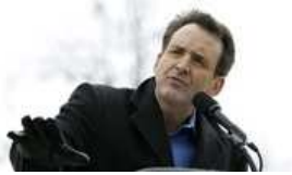
Pawlenty commits to South Carolina debate