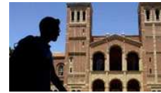
Opinion: Is college still worth it?