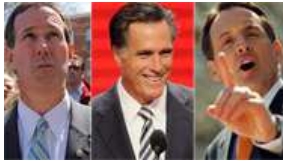
There are a number of players in the GOP presidential arena, but only a few have suited up

still in an exploratory phase, waiting until the pace of the campaign picked up before making a showier splash.