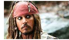
Review: 'Pirates of the Caribbean: On Stranger Tides'