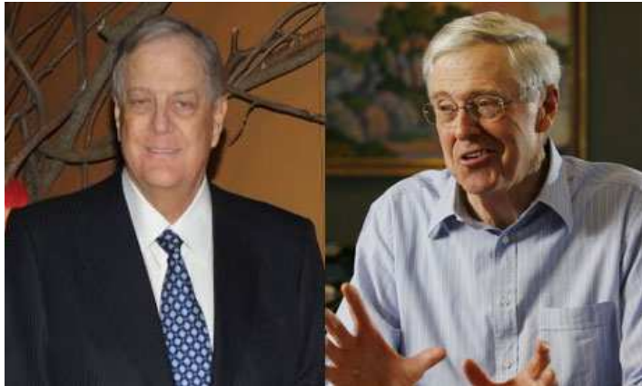
David, left and Charles Koch, employ 30 people in Washington, backed by millions of dollars, seeking to influence more than 100 pieces of federal legislation.

Paul Harris in New York The Observer, Sunday 15 May 2011