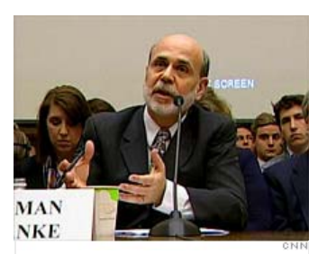
Fed chief Ben Bernanke seems ready to play let's make a deal with Congress

This represents a softening of Bernanke's opposition to an audit of some Fed operations by the GAO, the investigative arm of Congress.