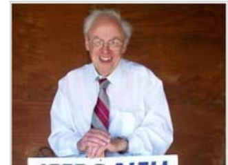
First Annual Government Sucks Day Rally