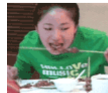
전문가도 놀란 양파즙 6가지!