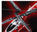
아빠 취미는 성인장난감