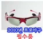
2010년 프로야구 필수품