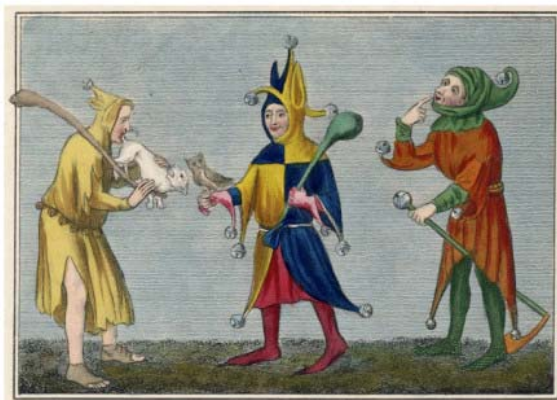
A foreign policy team?

Posted by Sun Tzu Aug 13th 2011 at 9:53 am in Foreign Policy, Humanitarian, Middle East, Obama, human rights | Comments (26)