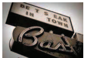
The Colfax Love Photosafari