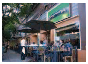
Up Close: Dougherty's