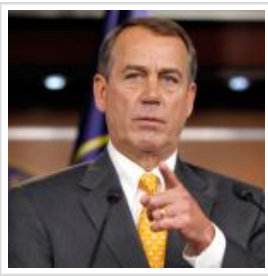
All That Stands Between You & the Spending Cuts Our Economy Needs: Senate Dems & An “Army of Lobb ...