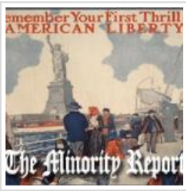
Speaker Boehner Praises House for Passing “Cut, Cap, & Balance” Plan