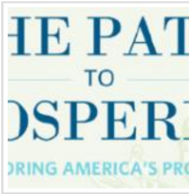
House Budget Committee – Fiscal Year 2012 Budget Resolution