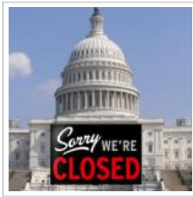
Why Would the White House Threaten to Veto a Responsible Troop Funding Bill? To Shut Down the Gov ...

September 7, 2011 New Posts Barack Obama Business Employment Job creation program Job Search Republicans United States White House