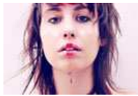
Who should be on a cover of Rolling Stone?