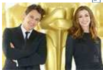
A huge upset and some expected wins