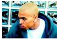
Troubled singer debuts new hair color