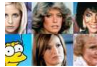
Do you agree with #1 on the list?