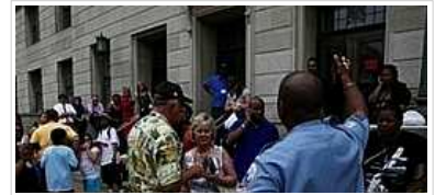
Shooting at Holocaust Museum Rep. Frank on GOP & Financial Disaster On Palin's Response to Letterman