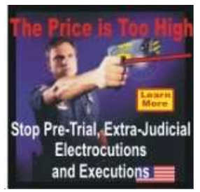
Get the widget.