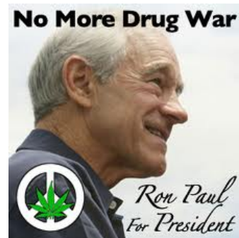
Ron Paul