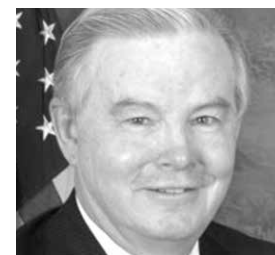
Joe Barton U.S. Representative - TX