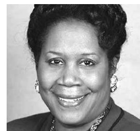
Sheila Jackson Lee U.S. Representative - TX