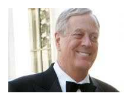
by Eric Dondero

It's now turning Leftwing vs. Libertarians: AFP attacked as "Koch funded"