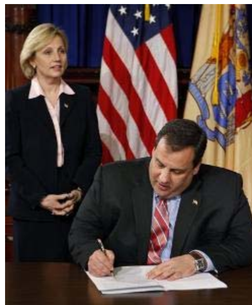
Republican New Jersey Gov. Chris Christie

Shortly after his inauguration, Gov. Christie used the office's broad powers to slash $560 million in