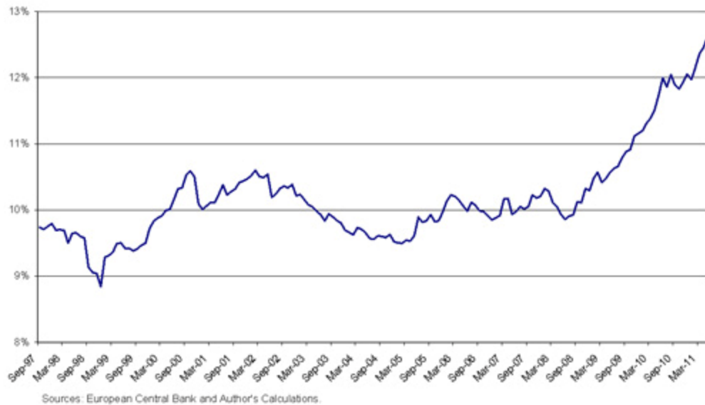
Eurozone Capital Ratio (Capital and Reserves to Banks' Non-Cash Assets)

The oracles have erupted in cheers at the increased capital-asset ratios. They assert that more capital has made the banks stronger and safer. While at first glance that might strike one as a reasonable conclusion, it is not the end of the story.