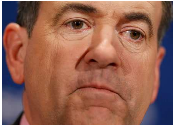
Should former Arkansas Gov. Mike Huckabee run for president?

Yesterday we made the case for why former Arkansas Gov. Mike Huckabee should run for -- and can win -- the Republican presidential nomination in 2012.