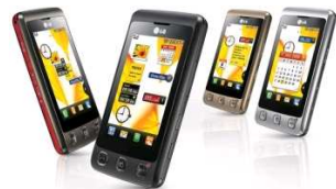
Twenty million owners flock to LG full touchscreen phones