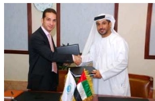
Abu Dhabi Fund for Development to develop National Medical Centre for in Yemen