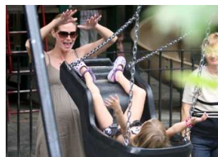
Doha - Exciting family fun on offer at Entertainment Village

A heavy sandstorm blankets Iraq's capital and reduces visibility, sending dozens of residents to hospitals with breathing difficulties. Watch Video