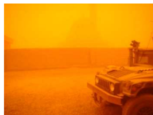
A heavy sandstorm blankets Baghdad