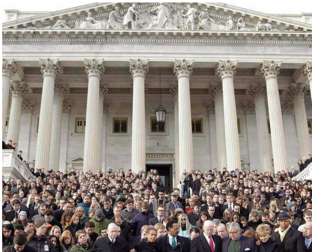
SOLIDARITY: Members of Congress and staffers gather outside the Capitol on Monday to observe a moment of silence for Arizona Rep. Gabrielle Giffords and other victims of the shooting rampage Saturday.

Efficacy of gun curbs disputed, underscoring East-West divide